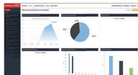
Advanced Threats Analytics.

Comodo's Default Deny Platform is one of the essential keys to effective web security as it allows known-good applications, while denying known-bad and containing any unknown files until a verdict is reached. In the meantime, users can remain productive by running unknown files safely and securely within a portable container that doesn't require any new infrastructure, software or agent installations.