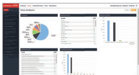
Unified dashboard for malicious files, domains and urls.

Valkyrie has the fastest file verdict capabilities in the industry and utilizes a combination of static, dynamic and advanced behavioral analysis to inspect files as they're being downloaded. It quickly renders risk verdicts for any file - normally within 40 seconds - five times faster than our closest competitor. The most dangerous files are classed as unknown and are immediately placed into a contained state before being delivered to the end user. At the same time, the file is undergoing an even more extensive analysis, including examination by human experts at Comodo's Advanced Threat Research Labs. When a final verdict arrives, the file is either released from containment or deleted and blocked (blacklisted).