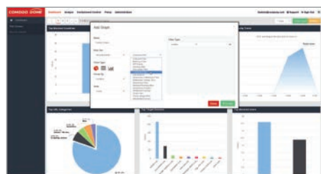
Easily customizable dashboards.